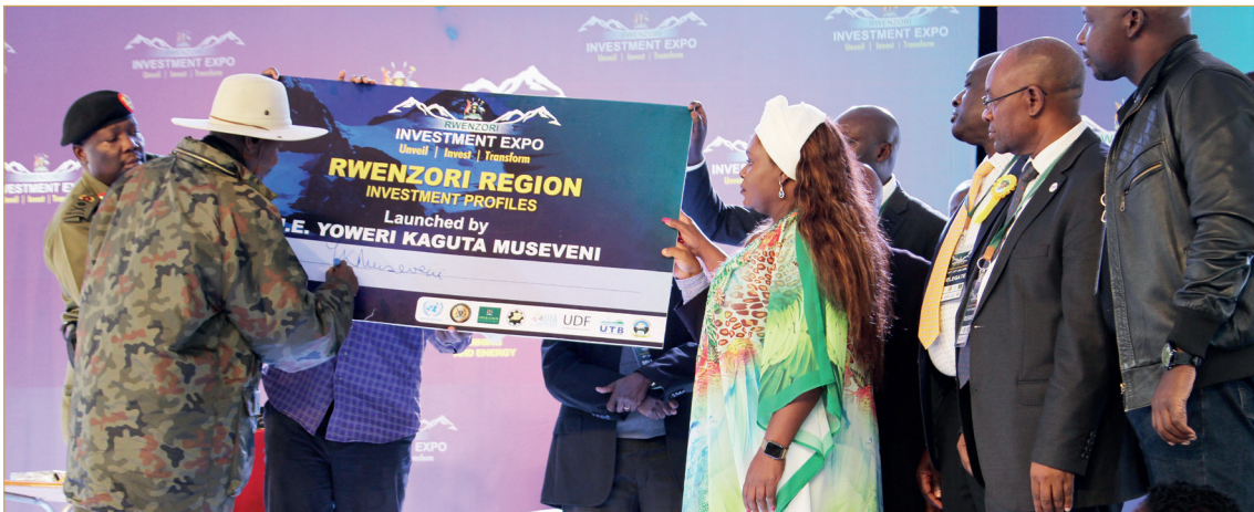
President Museveni Launching the Rwenzori Region Investment Expo Jan 31, 2020 in Fort portal District, south western Uganda

The UN Country Team in Uganda is collaborating with the Office of Special Envoy for the Great Lakes (OSEGL) in supporting the upcoming Great Lakes Investment and Trade Conference (GLITC) scheduled for 18th-20th March 2020 in Kigali, Rwanda. The Conference will focus on: “cross-border investment and trade as a catalyst for regional integration”.