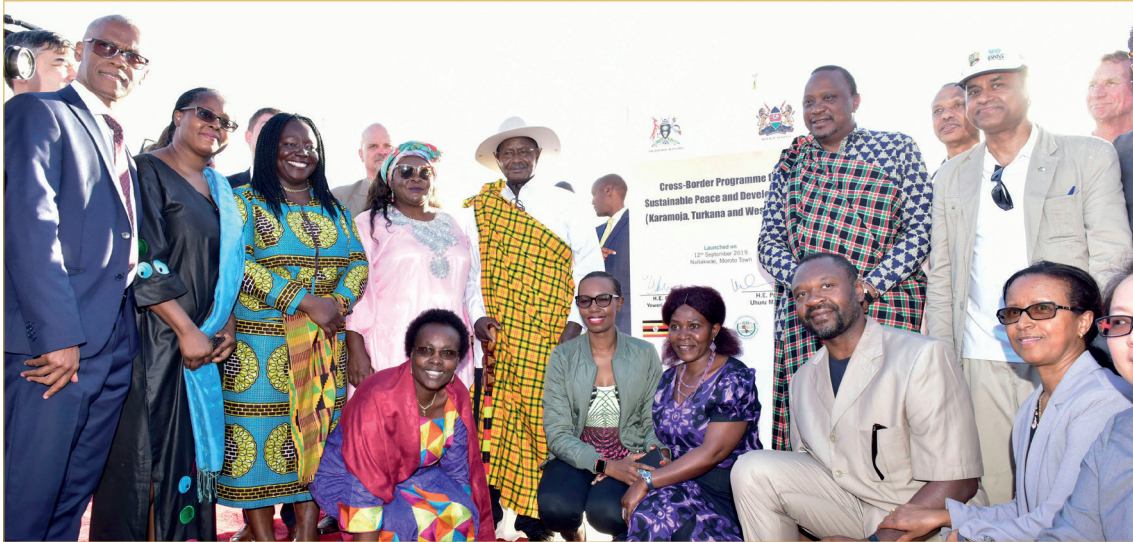
President Yoweri Museveni and President Uhuru Kenyatta, wrapped in Karamojong blankets, with members of the Uganda and Kenya Country Teams during the launch of the Cross-Programme on 12 September 2019 in Moroto

President Yoweri Museveni of Uganda and President Uhuru Kenyatta of Kenya jointly launch of the Karamoja Cross-border Programme for Sustainable Peace and Development on 12 September 2019 in in Karamoja, Turkana and West Pokot. The programme is supported by the UN Country Teams of Uganda and Kenya.