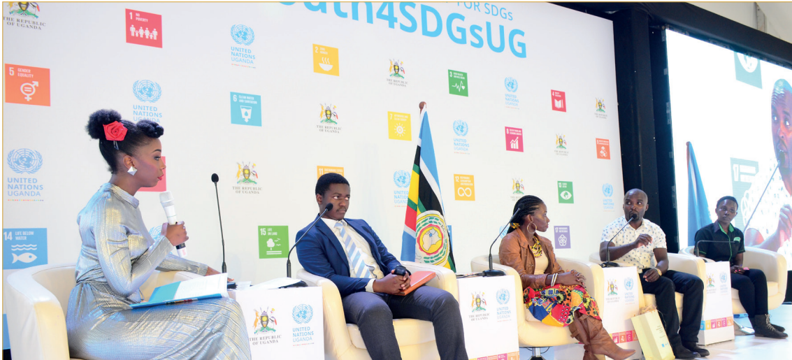
A Youth Panel discussing Youth contribution to the SDGs in Uganda during UN Day 2019 Commemoration at Kololo grounds, Kampala

The Government of Uganda embarked on the process of observing UN Day as a national holiday in 2019. The national commemoration on 24th October 2019 was organised by a National Organising Committee (NOC) with representatives from government ministries, departments and agencies, private sector, civil society organisations including youth groups and UN agencies. During the celebrations 21 youth innovators were chosen to showcase their solutions to development challenges in the country. For 2020, UN and partners are working on criteria to establish a Uganda SDG Seal that will be given every year starting this one to those chosen to have impactful solutions to national development bottlenecks.