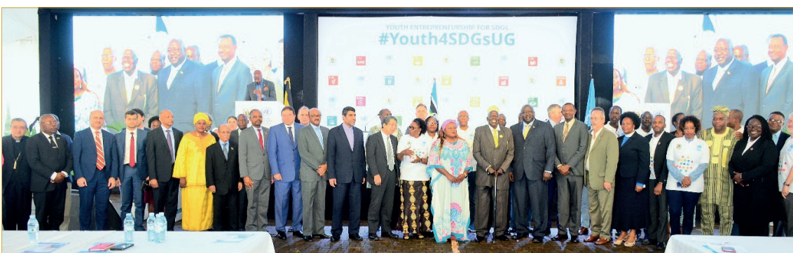
A group photo of Key dignitaries from Government, Diplomatic Community, NGOs, Private Sector and UN Heads of Agencies during UN Day Commemoration on 24th October 2019 at Kololo Airstrip, Kampala