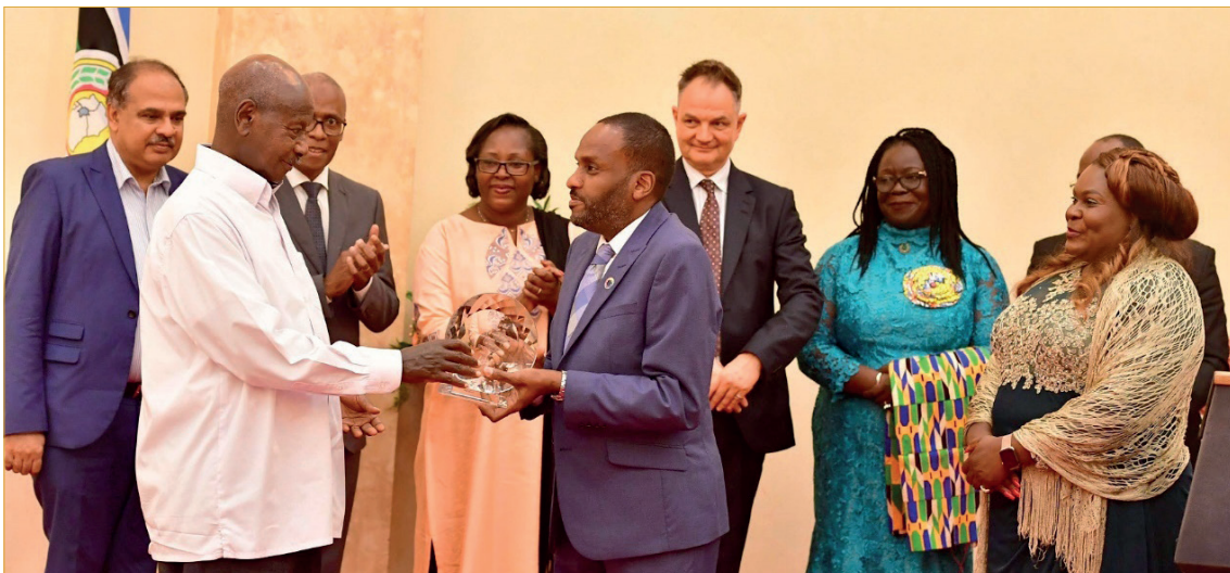
Outgoing IOM Chief of Mission in Uganda receiving a plaque from H.E. Yoweri K. Museveni, President of the Republic of Uganda during UN Day State dinner at State House Entebbe

On 26th October 2019, the President of Uganda hosted the UN Country Team and their invited guests to the first ever State Dinner to celebrate the 74th Anniversary of the UN and 57 Anniversary of Uganda's membership to the UN. The invited UN guests at the dinner at State House, Entebbe included cabinet ministers, members of the diplomatic community, civil society and award winning youth innovators involved in the promotion of the SDGs.