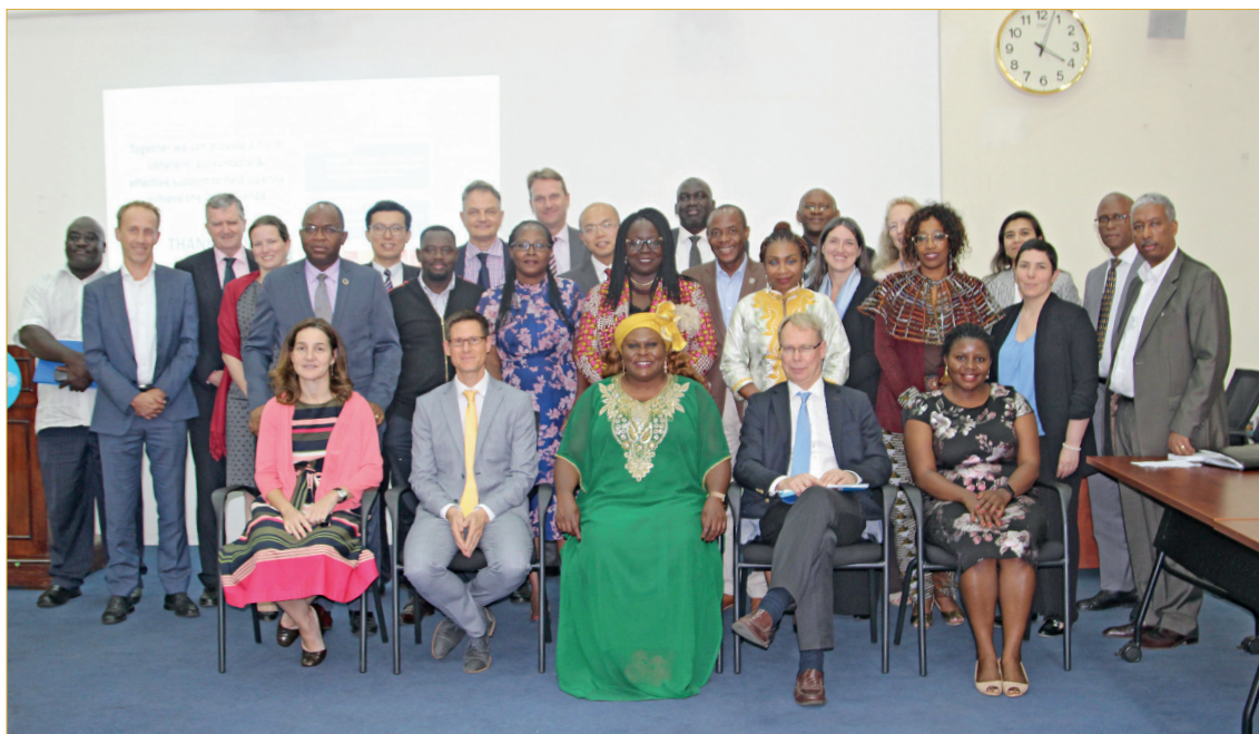
A group photo of New Generation UN Country Team after their first meeting at UNICEF offices in Kampala