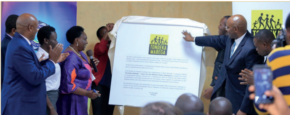
Minister for General Duties and Cabinet Focal Point on the SDGs, Hon. Mary Karoro Okurut relaunches a local campaign dubbed “Tondeka Mabega” – Leave No One Behind Citizen Dialogues.