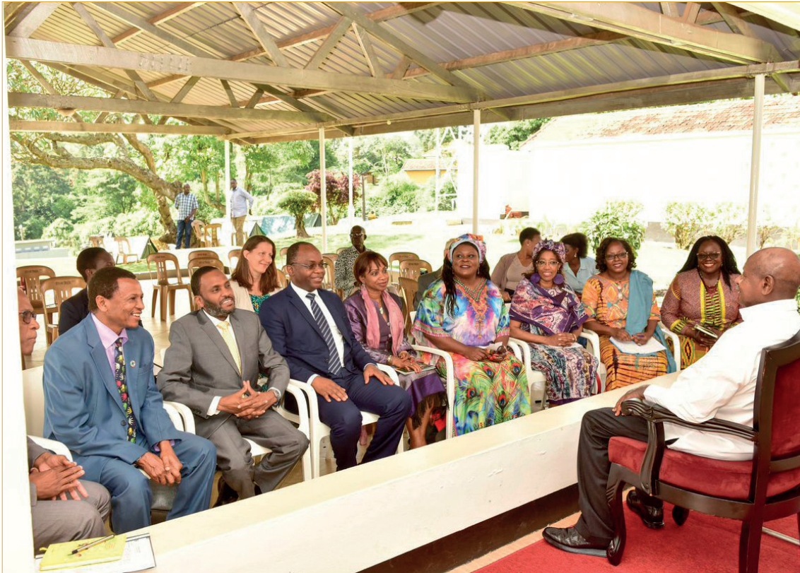
H.E. Yoweri K. Museveni, President of the Republic of Uganda addressing UN Country Team at Mbale State Lodge.