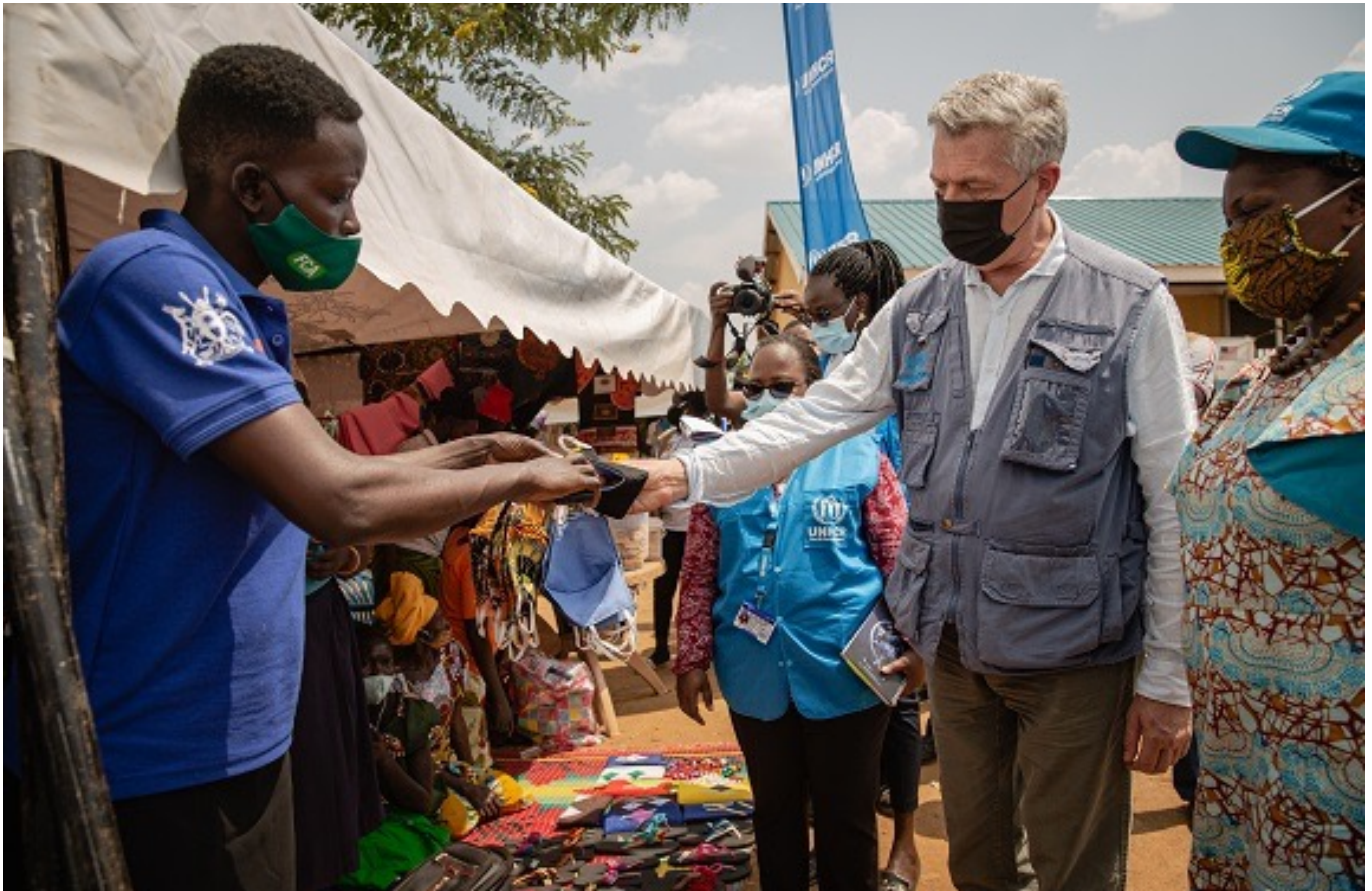
UN High Commissioner for Refugees, Filippo Grandi meets with Golden Star women's group in Bidibidi refugee settlement. Refugees sell soap, masks and other items at local markets alongside Ugandan traders.