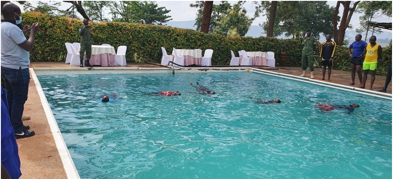
Trainees show off their maritime skills at the end of Phase 1 training