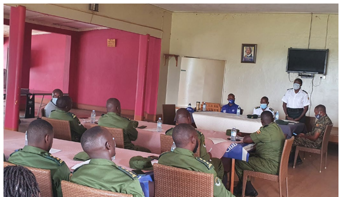
The maritime border security training included both practical and theory lessons

Over the years, IOM, the Government of Japan, and other development partners, have been supporting the Government to address diverse immigration and border management challenges. This contributes to the pursuit of Sustainable Development Goal (SDG) 10.7 that calls for facilitation of safe, orderly and responsible migration and mobility of people. It is also in line with objective 11 of the Global Compact for Migration (GCM), on management of borders in an integrated, secure, and coordinated manner. 🌐