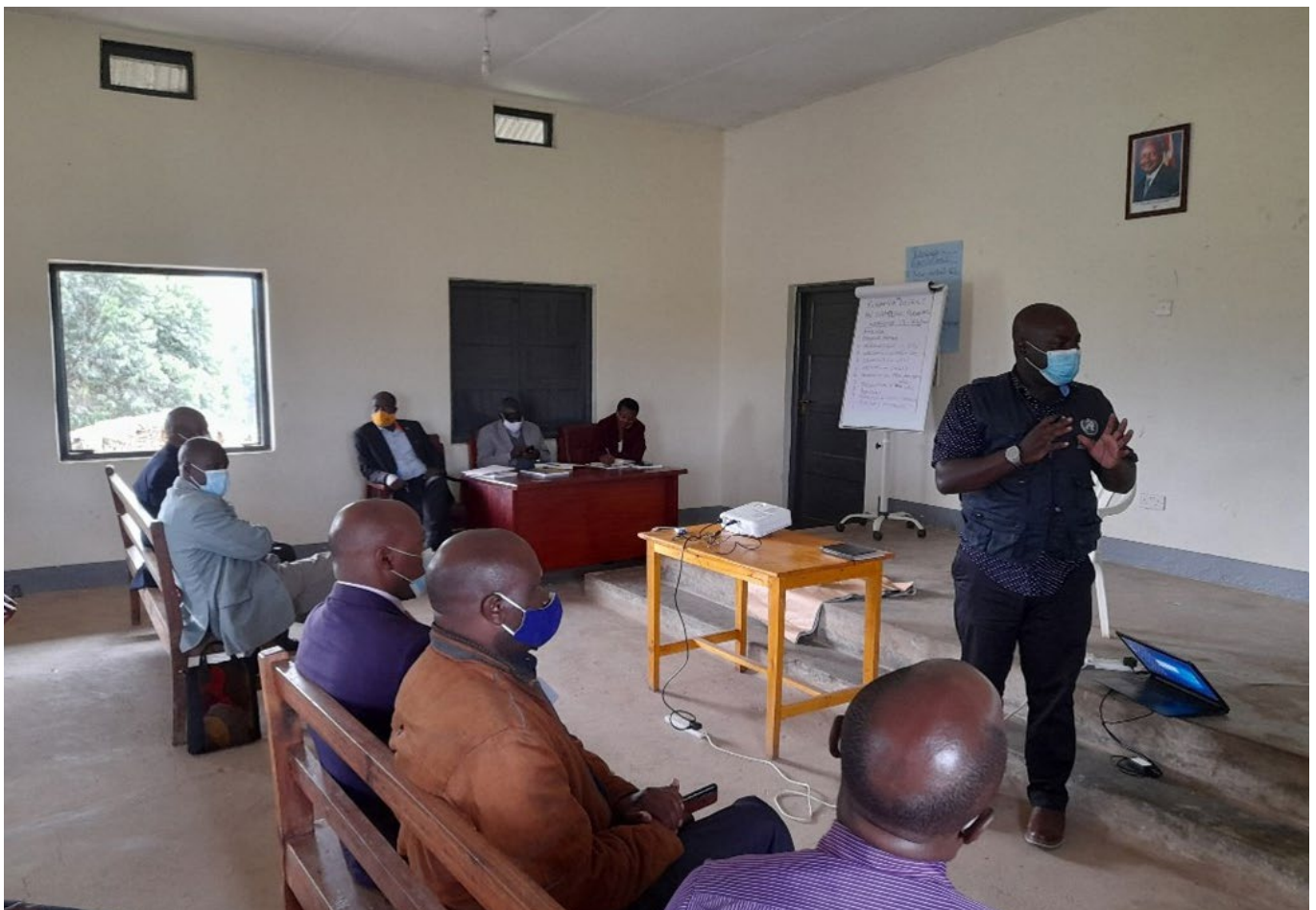
Partner coordination meeting led by the District Health Officer with support from the World Health Organization in Kasese District

Supported through funding from the United Nations Development Program (UNDP), the WHO field team in the Rwenzori sub-region is extending the Kasese partner coordination experience to other districts starting with Bunyangabu and Kabarole districts. For now, given its technical capacity, knowledge, mandate, clout, and comparative advantage, WHO is better positioned to assist the Ministry of Health and the district health team to play this role. 🌍