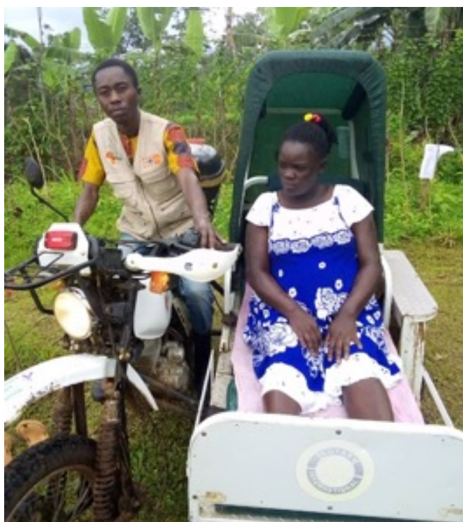
A pregnant woman onboard a motorcycle ambulance, ready to be transported to the Health Center III. Photo courtesy of Davis Mukimba

By Jimmy Dombo, UN Population Fund (UNFPA)