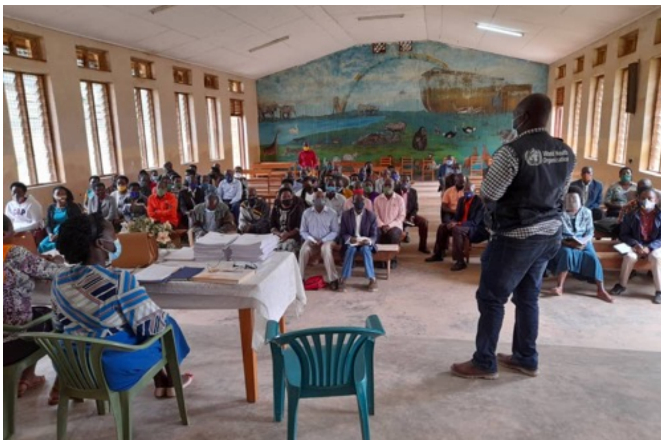
WHO training coordinators at sub-county level in Kasese District in prevention of COVID-19

By Edmond Mwebembezi, World Health Organization (WHO)