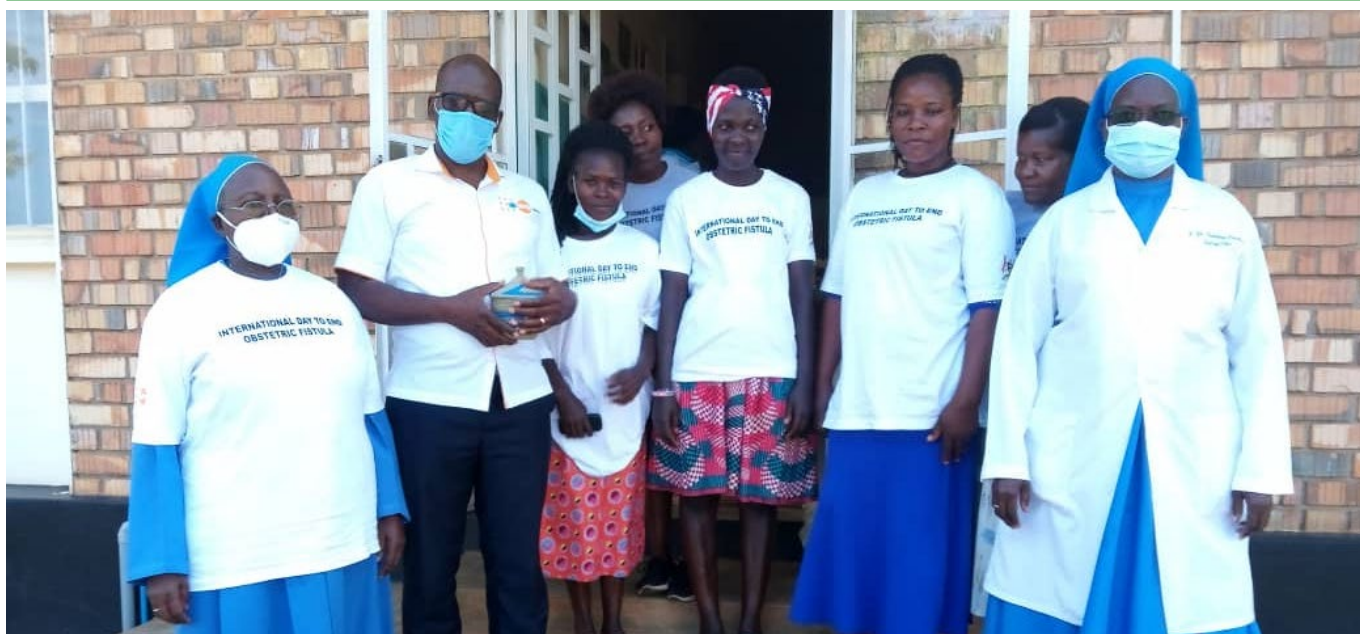
Fistula survivors pose for a photo with surgeons outside the recovery ward at Kitovu Mission hospital, Masaka