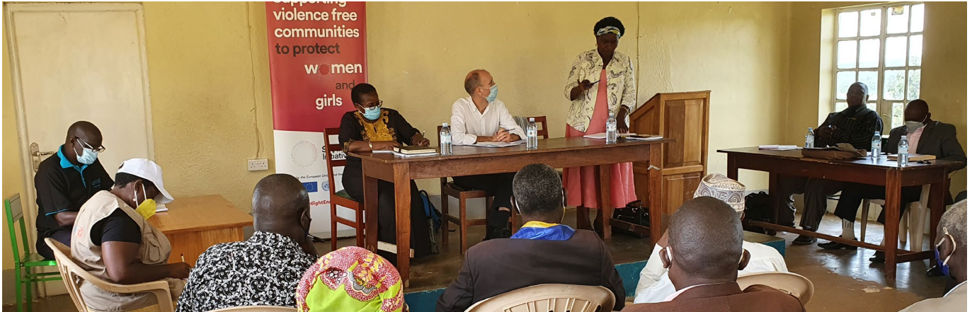
Caption: The Spotlight Initiative team interacting with District Local Government officials and Tooro cultural leaders in Kyegegwa, with the EU Delegation Head of Programmes, Governance, sitting in the center.