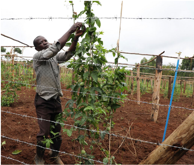
A member of Mabuyenzyo Farmers Group in Bukulula Sub-county, Kalungu district tends to the group passion fruit garden. The group also benefited from solar-powered irrigation system under the EU funded GCCA project