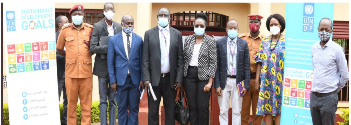
Stakeholders in front of Masaka Main Prison