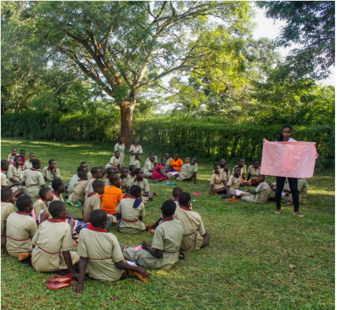
Training on making hygienic reusable sanitary pads

Our gratitude goes to Akina Mama wa Afrika and UN Women for the opportunity to run the Community Action Projects (CAP) as an end activity after our feminist leadership training. It empowered us to pass on the knowledge and insight attained as well as build our confidence and teamwork in serving the community. We are on the path to attaining our primary goal of creating a movement of girls/women feminists empowered holistically through a membership/SACCO approach. The community we chose welcomed our initiative and both the young mothers and the school leadership at Balawoli Primary committed to making the liquid soap on a large-scale basis with a goal of becoming the leading liquid soap supplier in the entire district. We intend to have continuity of this project in this area with a possibility of expanding to more villages and sub-counties in Kamuli District. We have a vision of partnering with local associations in the communities that are doing familiar work to avoid duplication of resources and also ensure project sustainability. 🌍