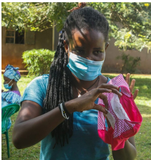
SHE-CAN project was run by The Thriving Women Initiative