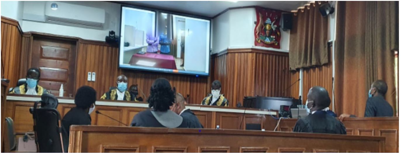
A visual display of the video conferencing system in use in the court at Masaka ©UNDP

By Joel Akena, United Nations Development Programme (UNDP)