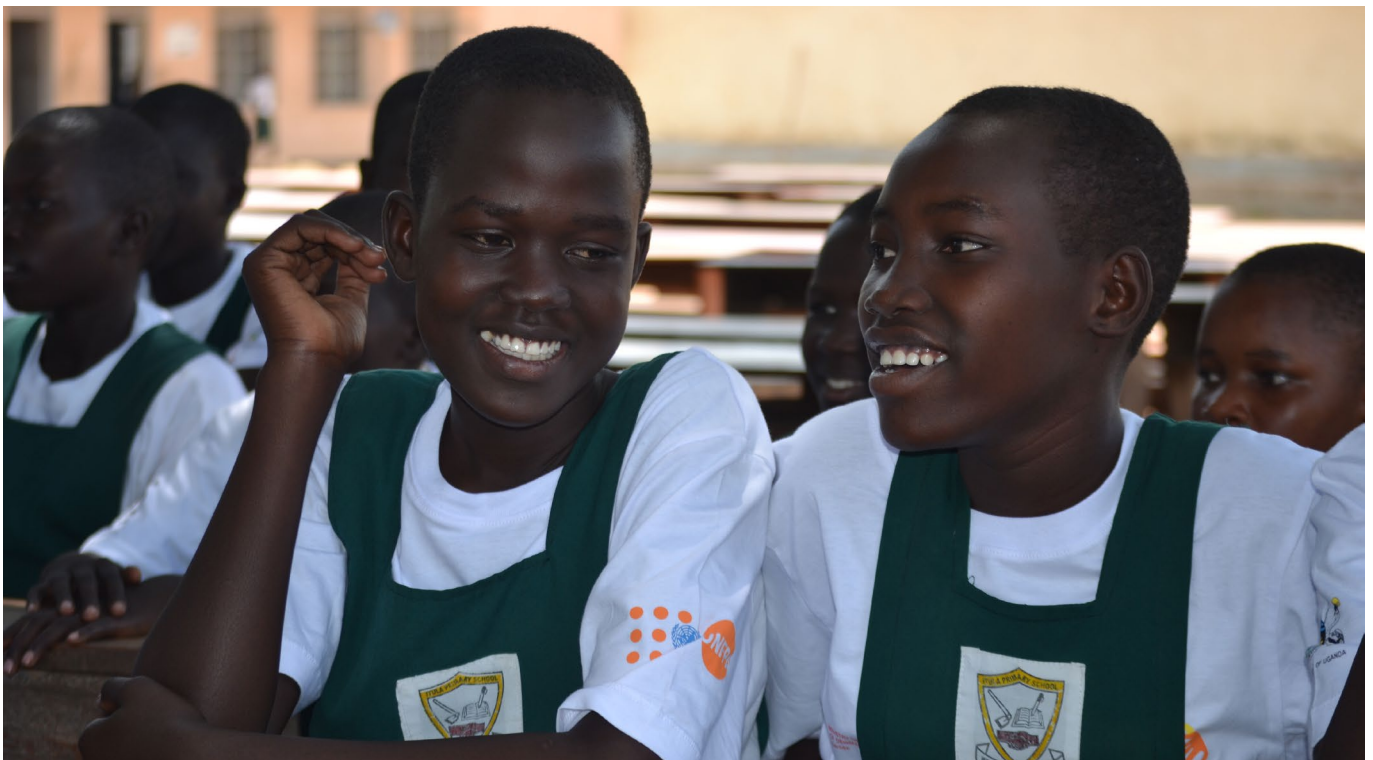
Providing access to sexual reproductive health information to young people can help them make informed choices about their health