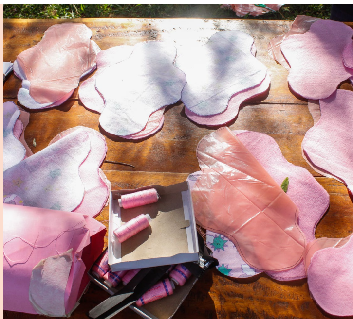
Training on making hygienic reusable sanitary pads