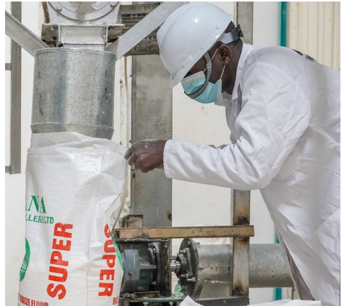
START provides concessional finance to agribusiness SMEs engaged in value addition. Kana Grain Millers in Omoro district, has used financing from the facility to purchase modern equipment for drying, storing and packaging maize flour.