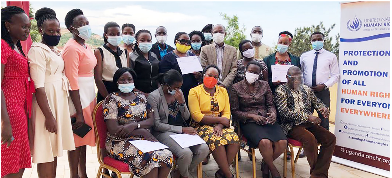
OHCHR Staff and Wakiso District Human Rights Committee members during the handover of IT equipment to the committee

By Bernard Amwine, Office of the High Commissioner for Human Rights (OHCHR)