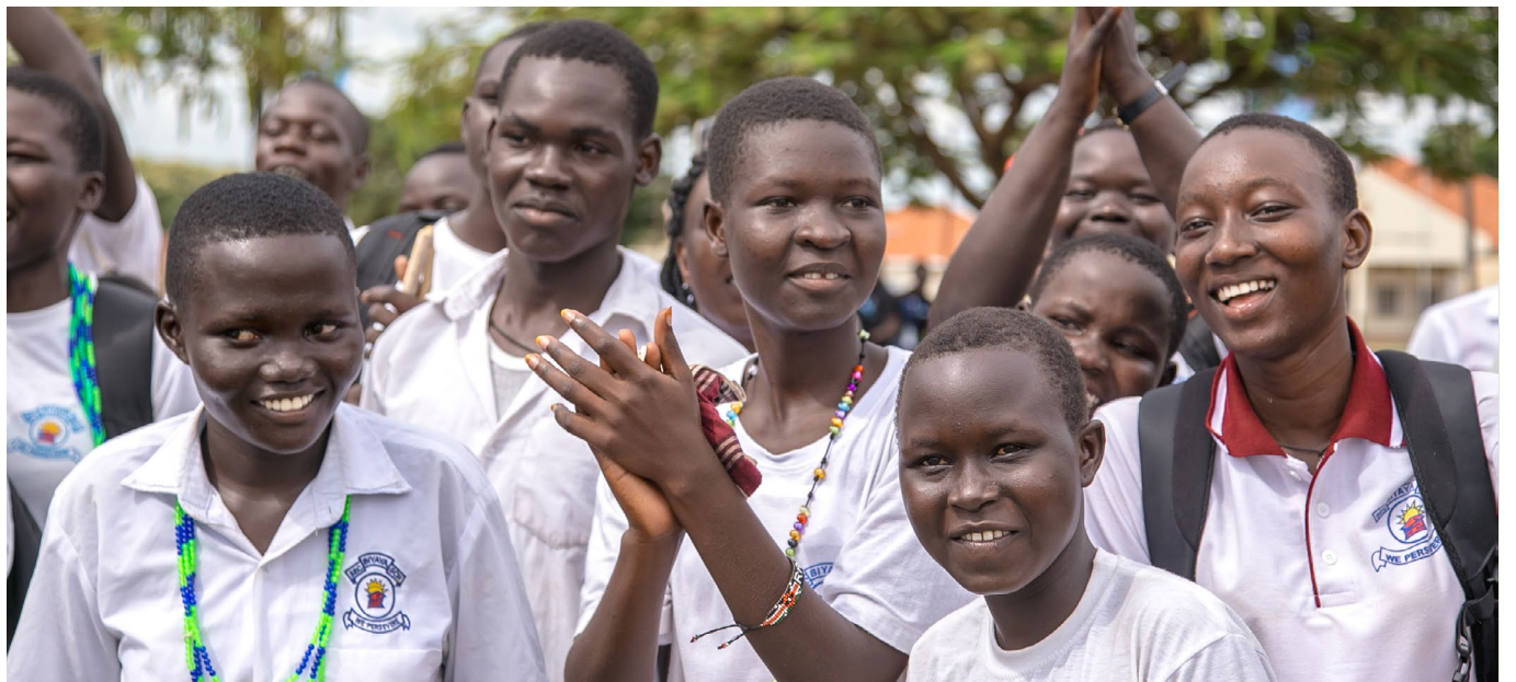
A group of learners in Adjumani district enjoying a light moment. By investing in adolescent and young people’s sexual and reproductive health services, development challenges including reducing teenage pregnancy and child marriage can be overcome to achieve Uganda’s Vision 2040 and the SDG Goals

The symposium was organized by National Population Council with support from UNFPA and funding form the Embassy of the Kingdom of Netherlands in Uganda. 🌍